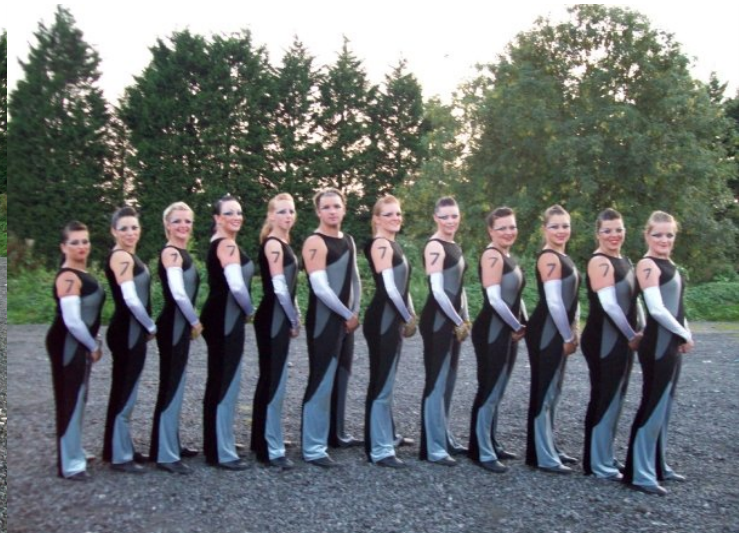
"Senators Colour Guard 2008"