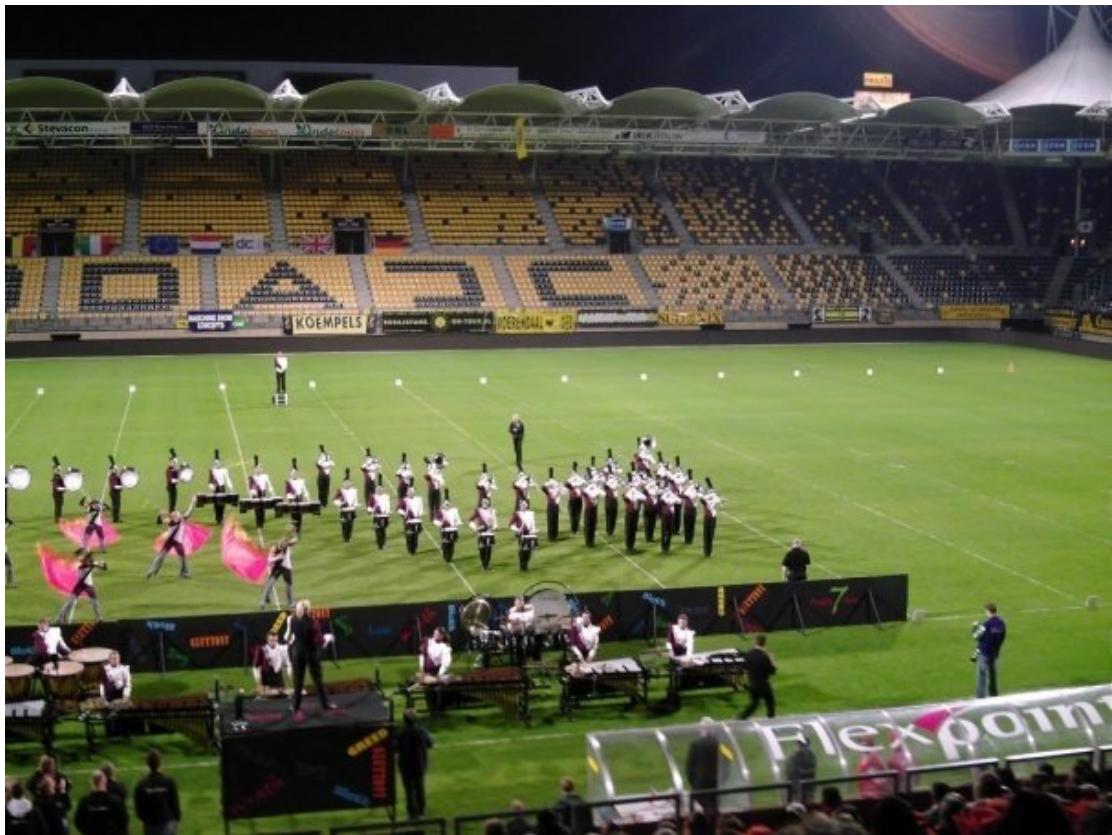
“Senators at the end of GLUTTONY on DCE Finals Night”

We then move into the ballad which is LUST and the piece is Candlelight by Imogen Heap, we really give the Colourguard and Front Ensemble chance to shine and back the Brass Line up as we slow the show down and give us more variety to the production.