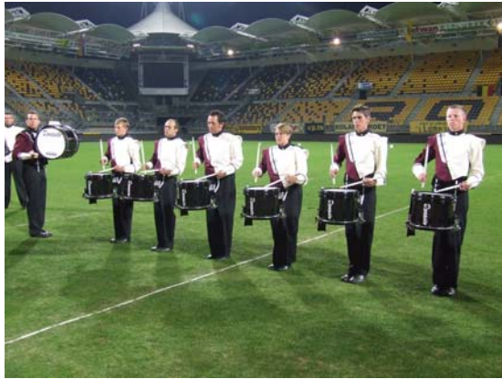
"Senators Snare Line Warm Up DCE Repeat"