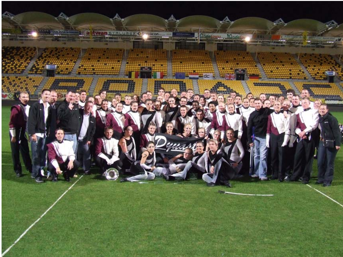
"Senators 2008 DCE Champions"

After the repeat we got chance to have photographs taken and to hang out which was a great tension release and I would like to share some of these with you