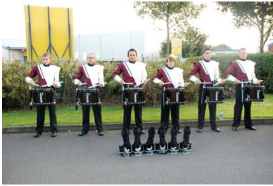
"Snare Line DCUK Finals Night"