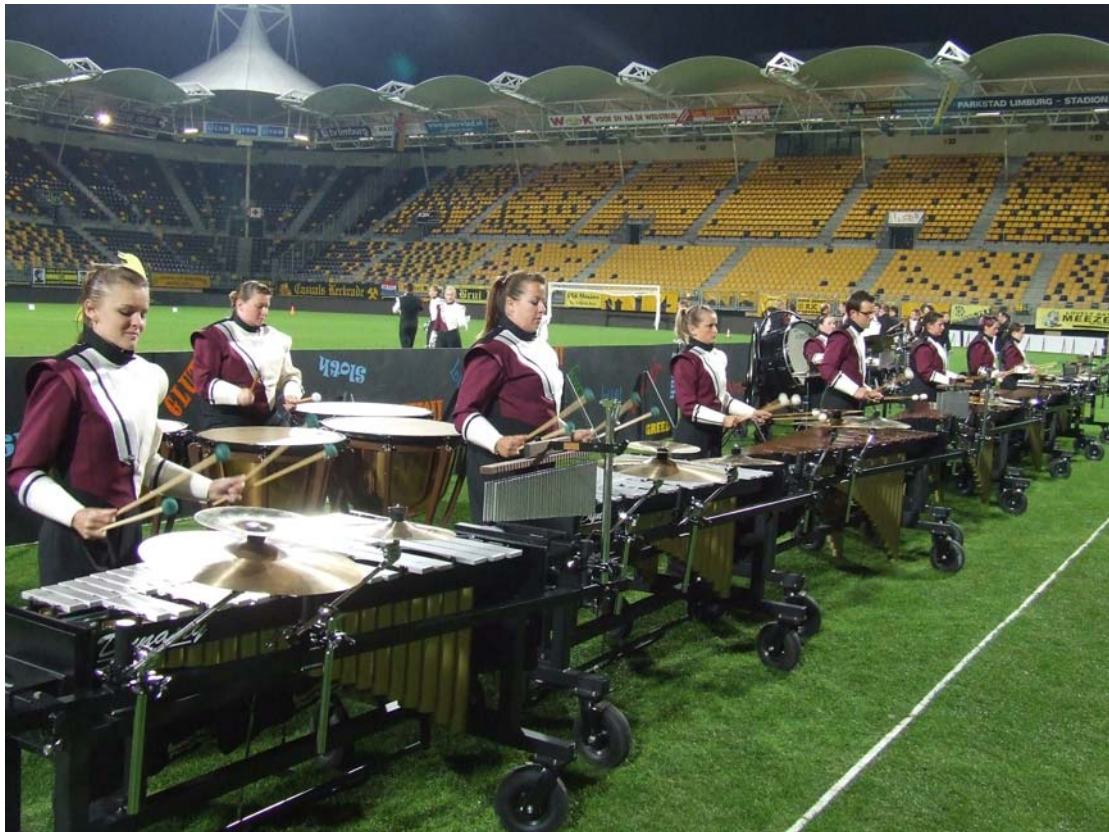
"High Front Ensemble 2006,07,08"