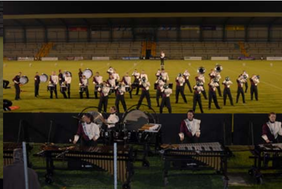
"Senators DCUK Finals Night"