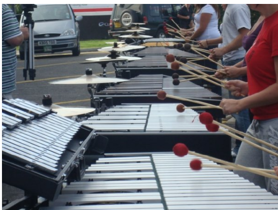
"Front Ensemble Warm Up DCUK Finals Day"

We had a successful run of competitions running into the DCUK Championships, which had seen us undefeated in going into the Finals at the Marstons Arena in Northwich. DCUK run things slightly differently as in there is no prelims performance on the day just an evening Finals show, however during the day each Corps has an opportunity to do an exhibition show. This is great as it gives the Staff a chance to sample the acoustics of the stadium and make any minor adjustments we feel necessary.