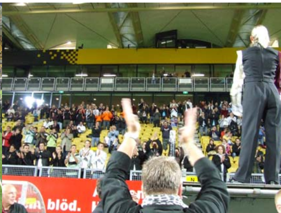
"Thanks to the audience at the end of the repeat"