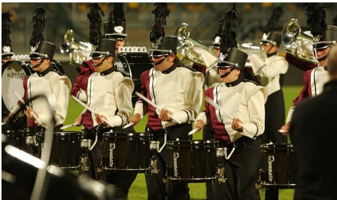
“Senators Snare Line during WRATH on DCE Finals Night”

The next sin is WRATH and this is possibly the hardest part of the show for the members who have to portray aggressiveness whilst staying in control. It is a highlight of the show for many people with again fast movement, strong work from all sections which culminates in a huge “Rock Out” section near the end of the piece where the members just get chance to perform the heck out of the show and you can see it in their eyes.