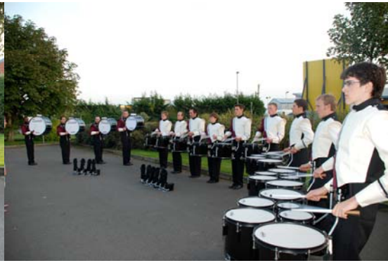
"Battery DCUK Finals Night"