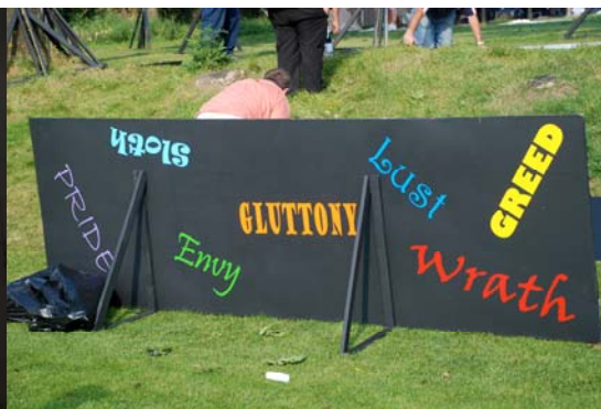
"Boards for the front of the field"