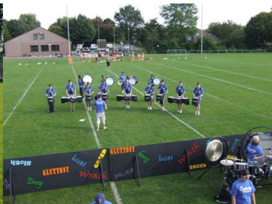
"Percussion Rehearsal in Kerkrade"