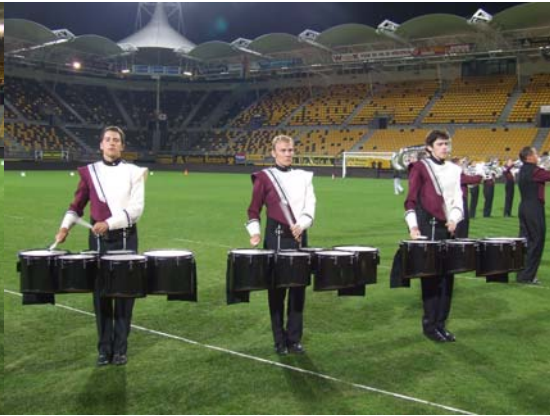
"Senators Tenor Line Warm Up DCE Repeat"