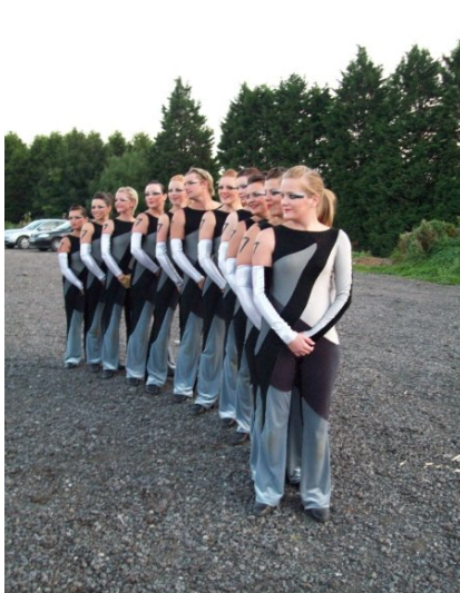
"Senators Colour Guard 2008"