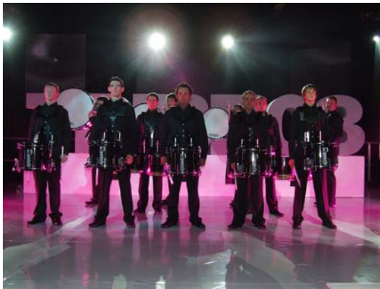
"Senators at Redken Tribe 2008"

The brief was to perform to Gwen Stefani's song "Hollaback Girl", although they used a live backing band for the event not Gwen. We were dressed in all black and they wanted us to drum and dance along the catwalk as the band played Hollaback Girl. As always we did a fantastic slot and the customer was really pleased with the Senators as we further cemented our reputation in the industry.