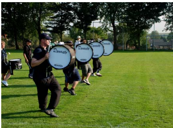
"Bass Line Rehearse in Kerkrade"

http://www.l1.nl:80/mediaplayer_landingpagina/_rp_links1_landing/1_true/_rp_links1_lsideold/1_2904676/_pid/links1