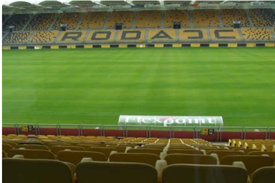
"JC Roda Stadium view from the stands"