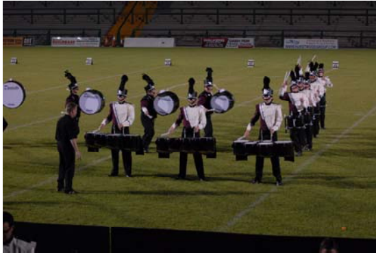
"Battery DCUK Finals Night"