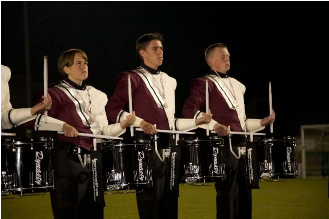
"A very proud Snare Line DCUK Finals 2008"

Normally following a Championships the usual thing would be to go back to our accommodation and have a good drink to celebrate, not this year!! We had achieved part 1 of the mission we now had to tackle the larger obstacle of DCE and the might of Beatrix and Jubal from Holland.