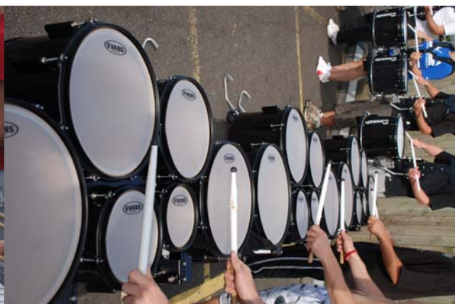
"Tenor Line Rehearsal DCUK Finals Day"