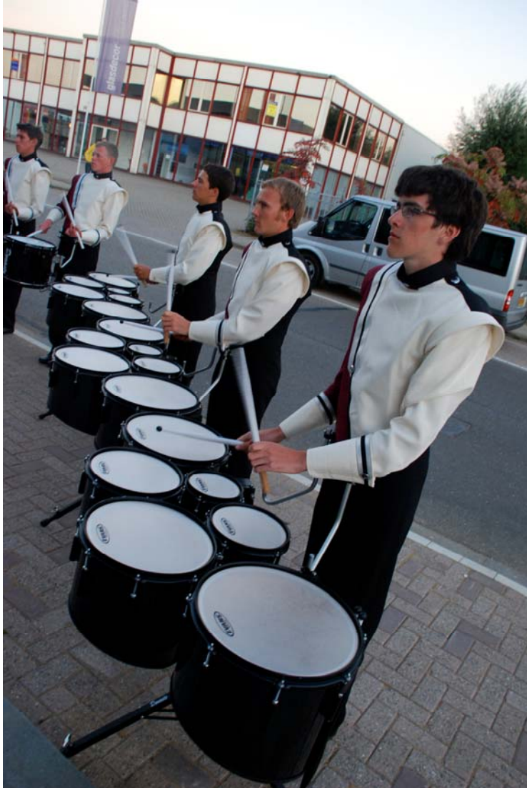
"Tenor Line DCE Finals Night"

After talking with everyone we decided to arrive early to warm up to give us plenty of time to prepare and let the members have a really long and productive warm up. Everyone could sense this was going to be a great night no one dared mention it though ☺